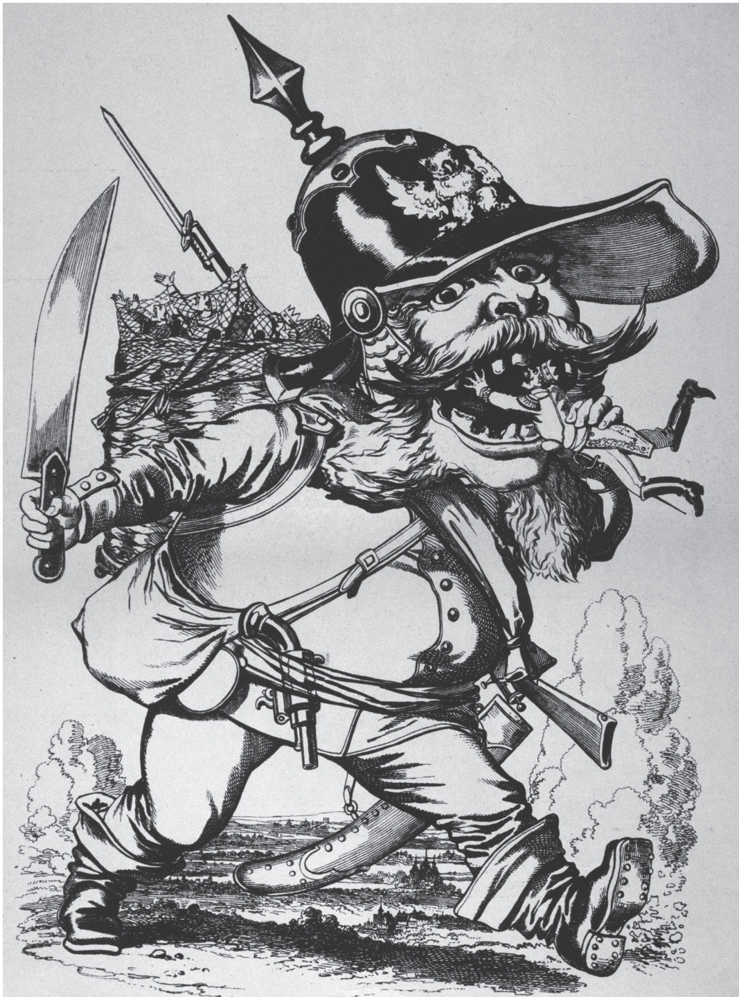
A French cartoon of King William I and the princes of northern Germany, 1867.