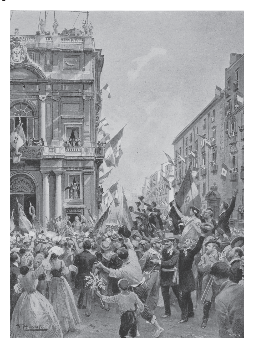
An Italian drawing from 1910 of Garibaldi announcing from a balcony in Naples the annexation of the Kingdom of the Two Sicilies to Italy in September 1860.