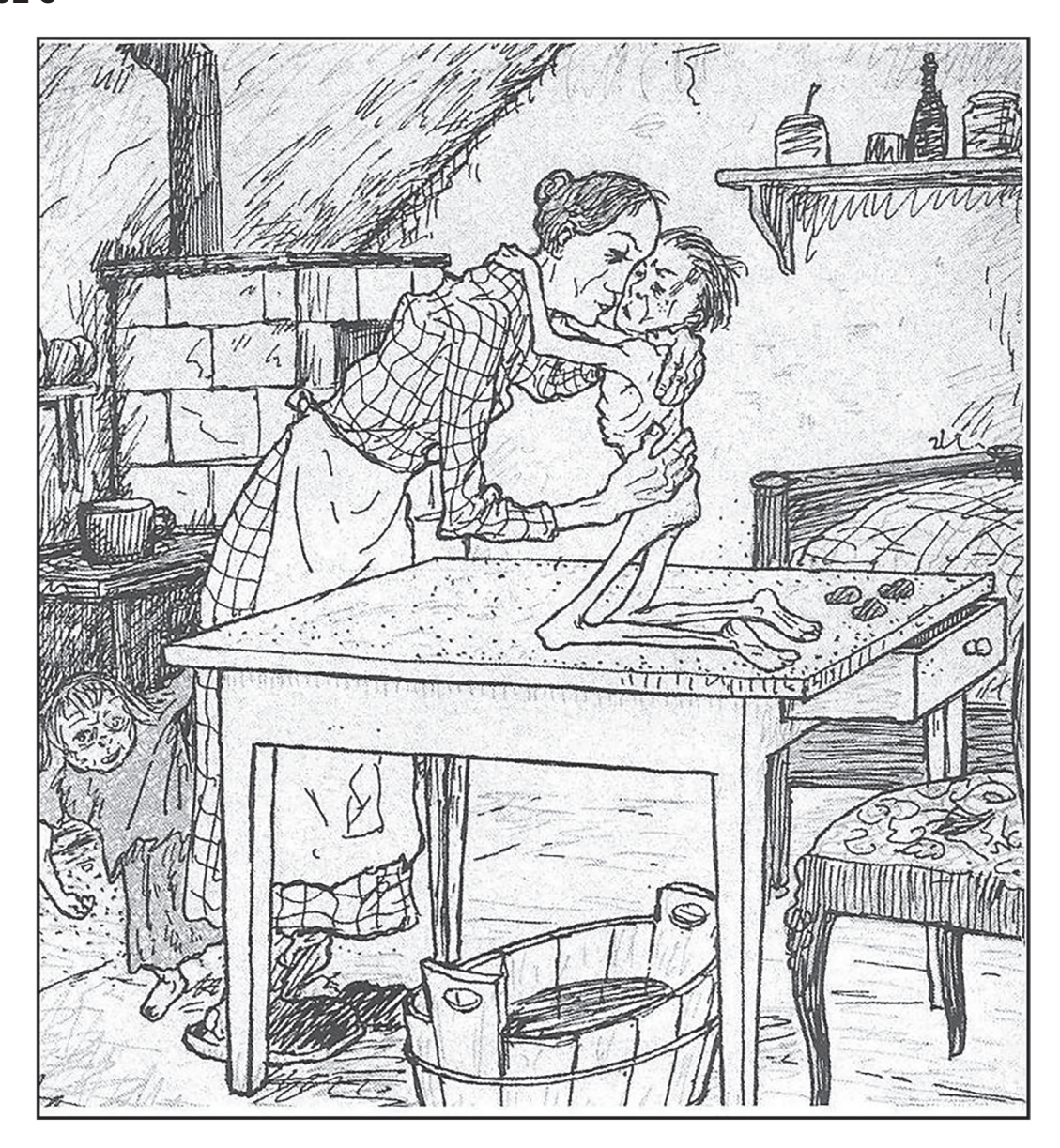
A cartoon entitled 'Consolation' published in a German magazine, 24 June 1919. The mother is saying to her child, 'When we have paid 100,000,000,000 marks, then I shall be able to give you something to eat.'