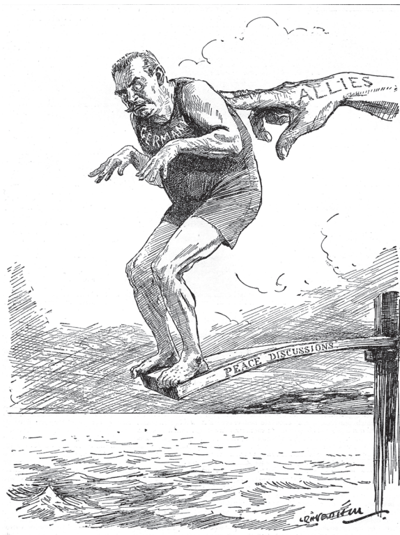
THE FINISHING TOUCH.

A cartoon published in a British magazine, June 1919. The words on the plank say 'Peace discussions'.