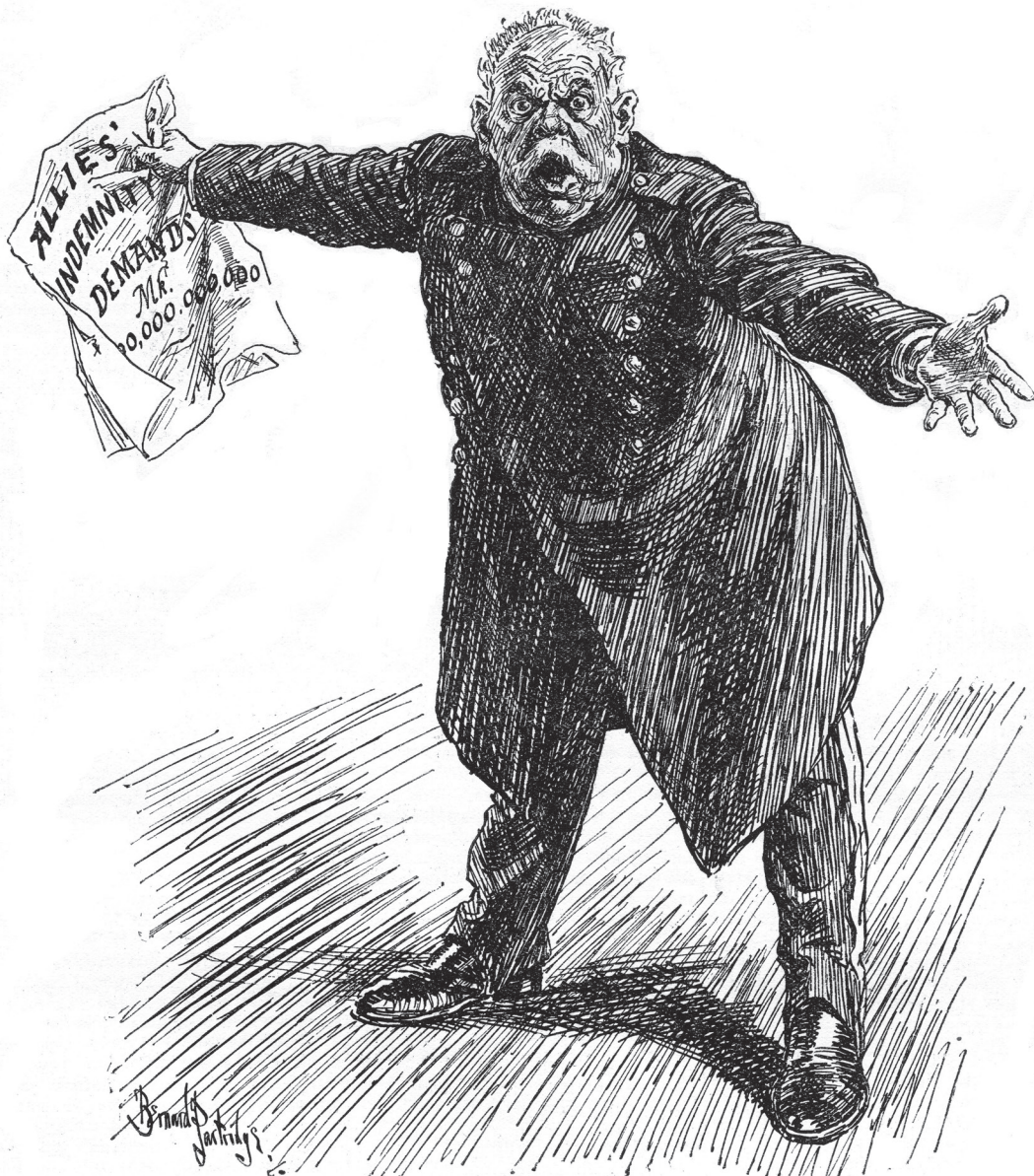
A British cartoon entitled 'The Reckoning', published in April 1919. Germany is saying, 'Monstrous, I call it. Why, it's fully a quarter of what we should have made them pay, if we'd won.' 'Indemnity demands' refers to the reparations.