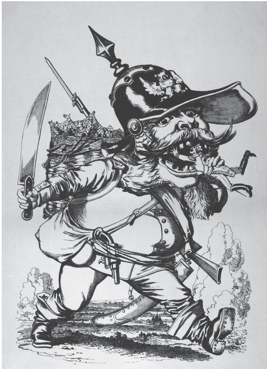
A French cartoon published in early 1867. It is entitled 'The Giant German Ogre'. It shows William and some small figures which represent the princes of North Germany.