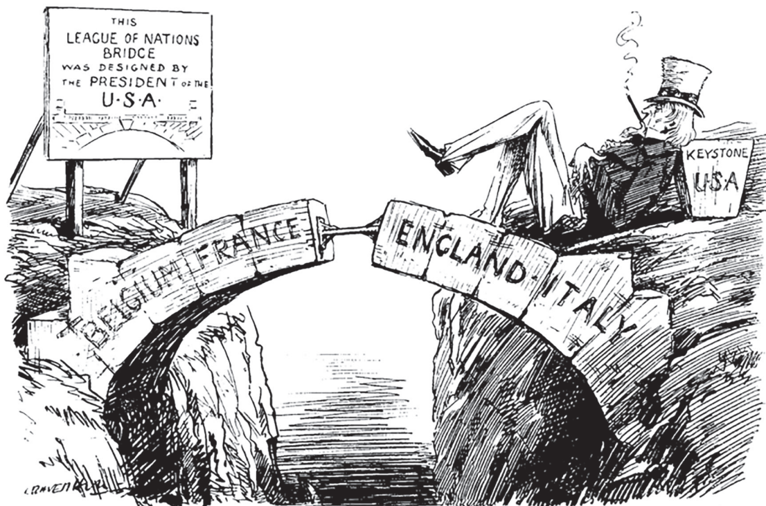
THE GAP IN THE BRIDGE.

A cartoon published in a British magazine, December 1919. The keystone is the stone that locks the structure together.