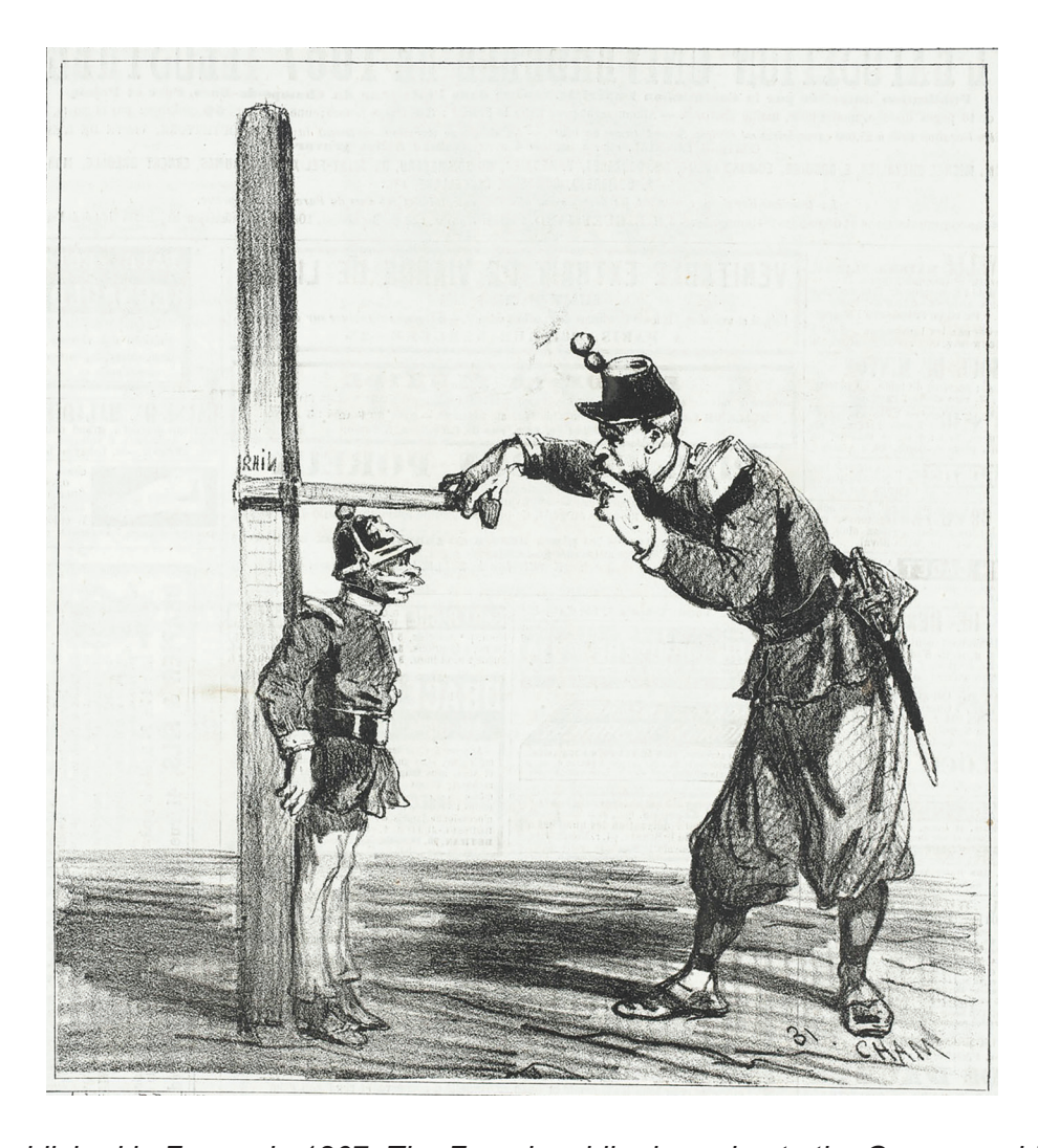
A cartoon published in France in 1867. The French soldier is saying to the German soldier, 'Now you are big enough. You must not get any bigger. I'm telling you this for your own health.'