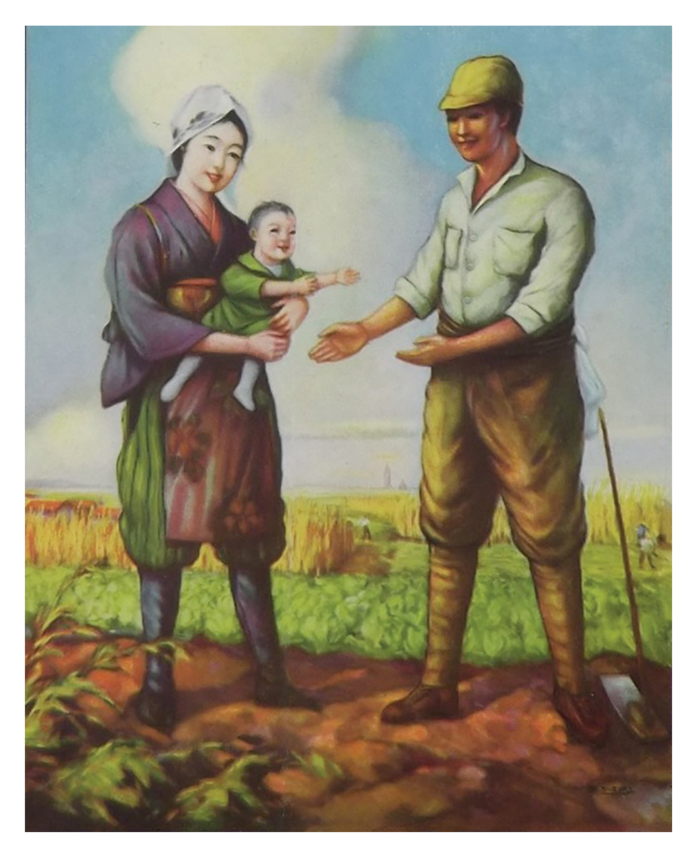
A poster published by the Japanese government in 1936 to celebrate the fifth anniversary of the Mukden Incident. It shows Japanese settlers in Manchukuo.