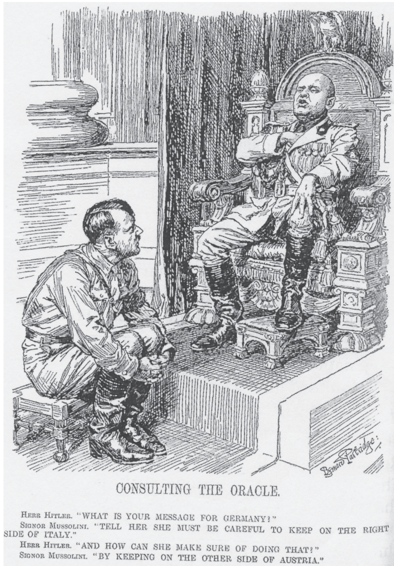
A British cartoon published in June 1934. An oracle is a person who gives wise advice.