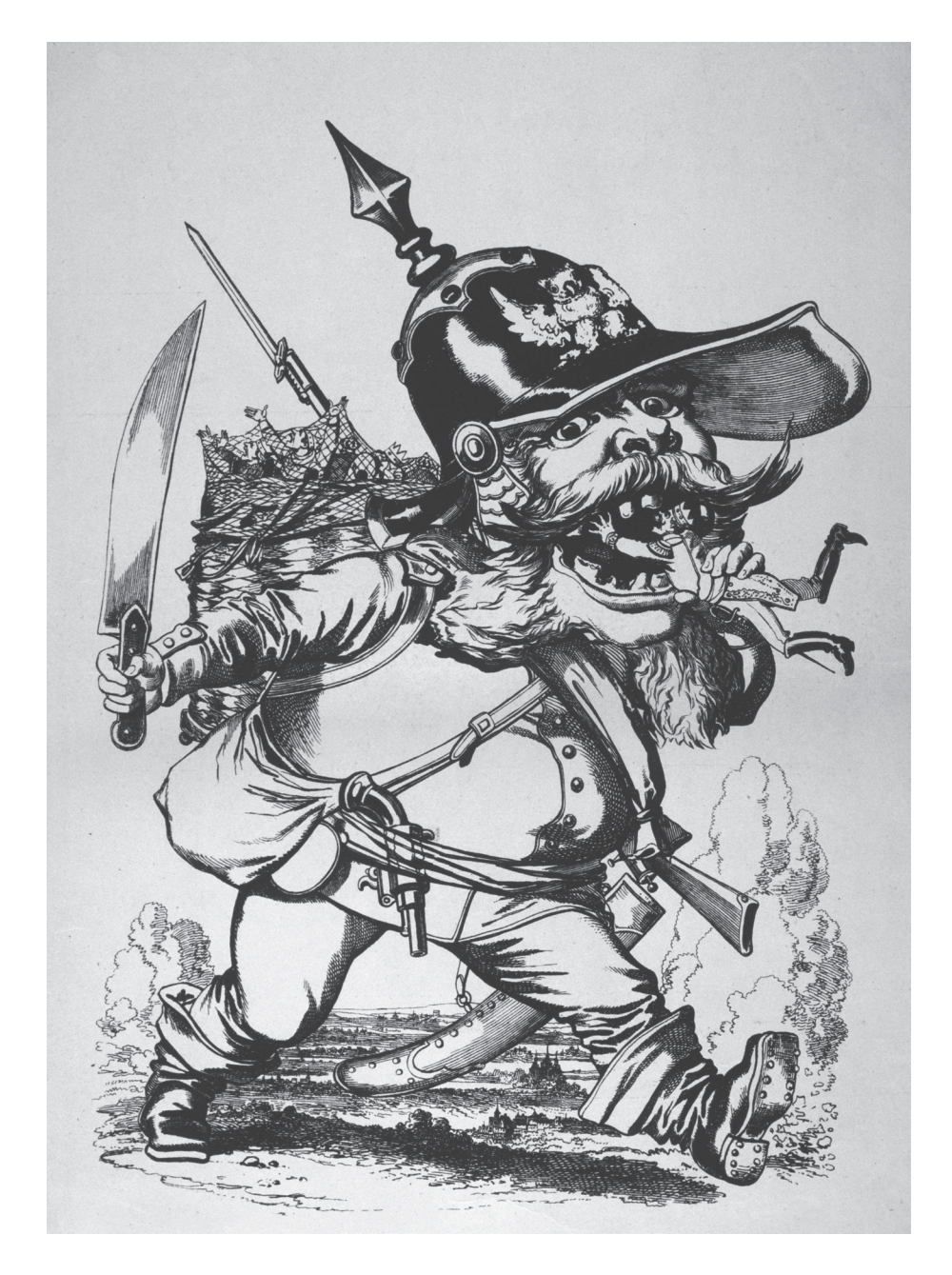
A French cartoon published in early 1867. It is entitled 'The Giant German Ogre'. It shows William and some small figures which represent the princes of North Germany.