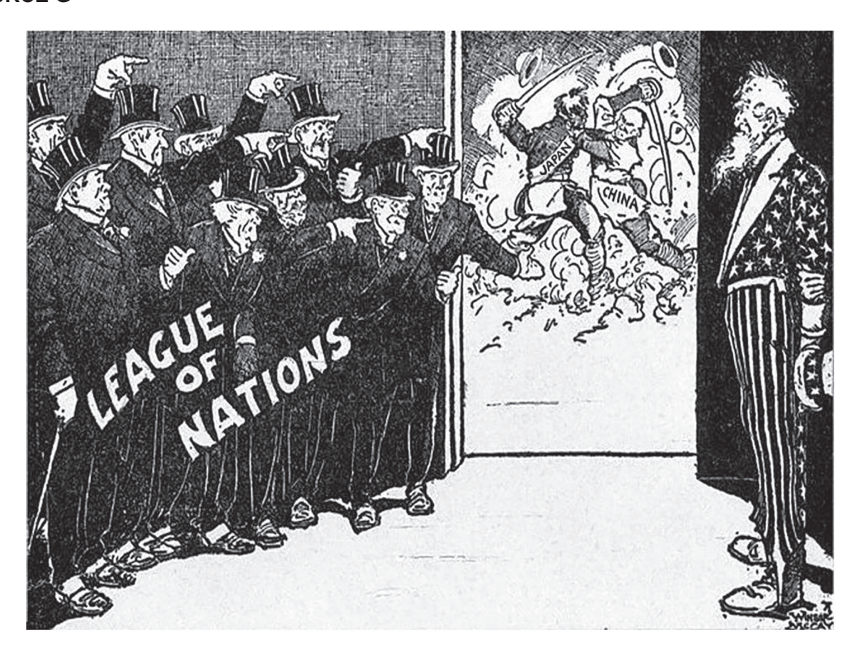
A cartoon published in 1932. The two figures fighting represent Japan and China.