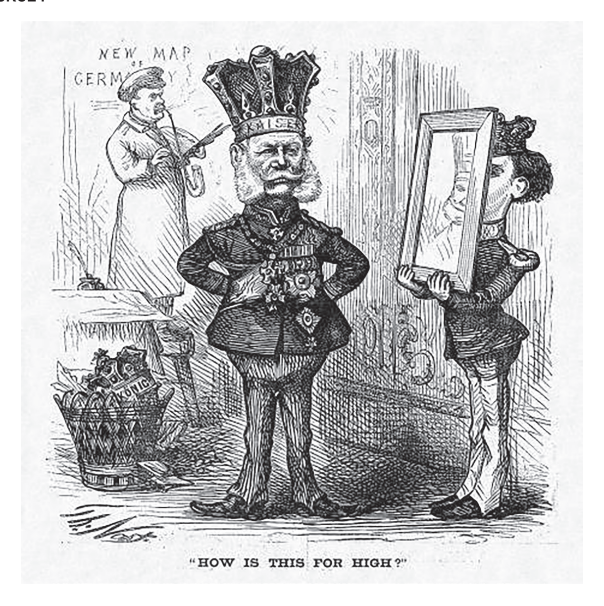
A cartoon published in an American magazine, 7 January 1871. Bismarck is in the background. William's Prussian crown lies in the waste bin.