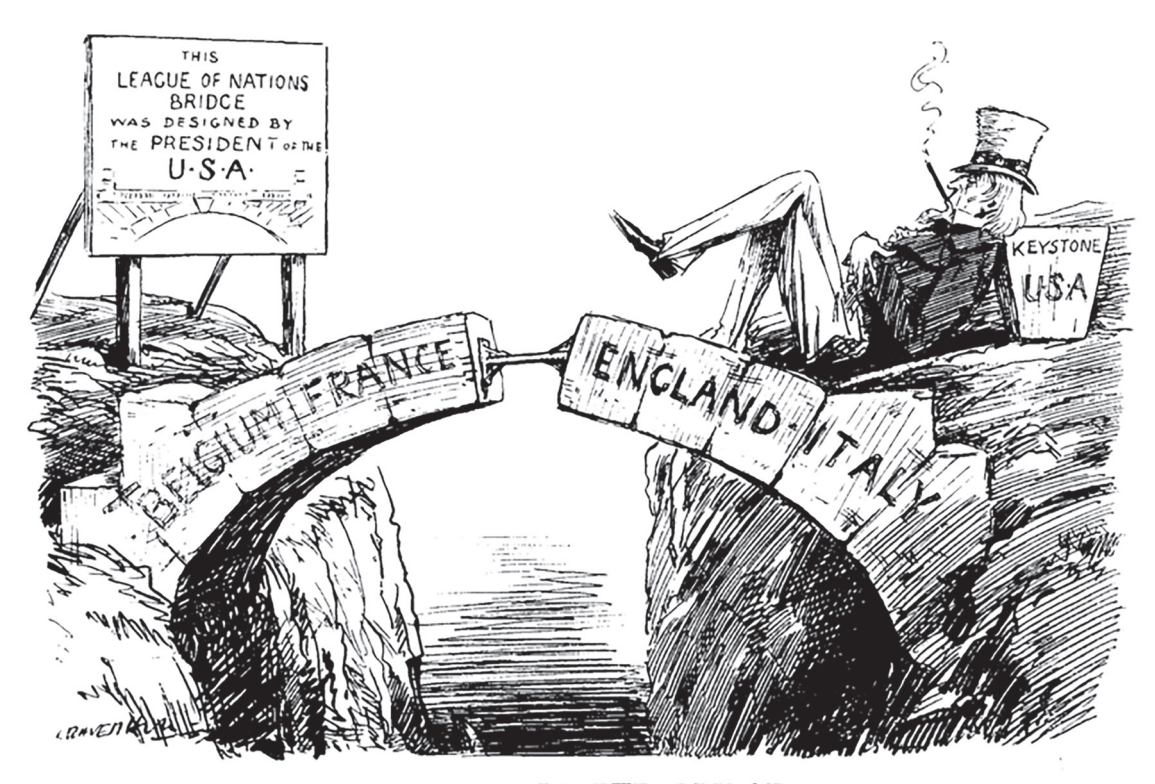
THE GAP IN THE BRIDGE.

A cartoon published in a British magazine, December 1919. The keystone is the stone that locks the structure together.