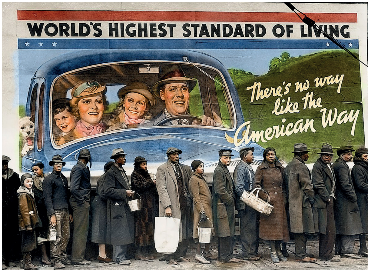
A photograph taken in Louisville, Kentucky, 1937. People wait in line for food and clothing from a relief station in front of a billboard.