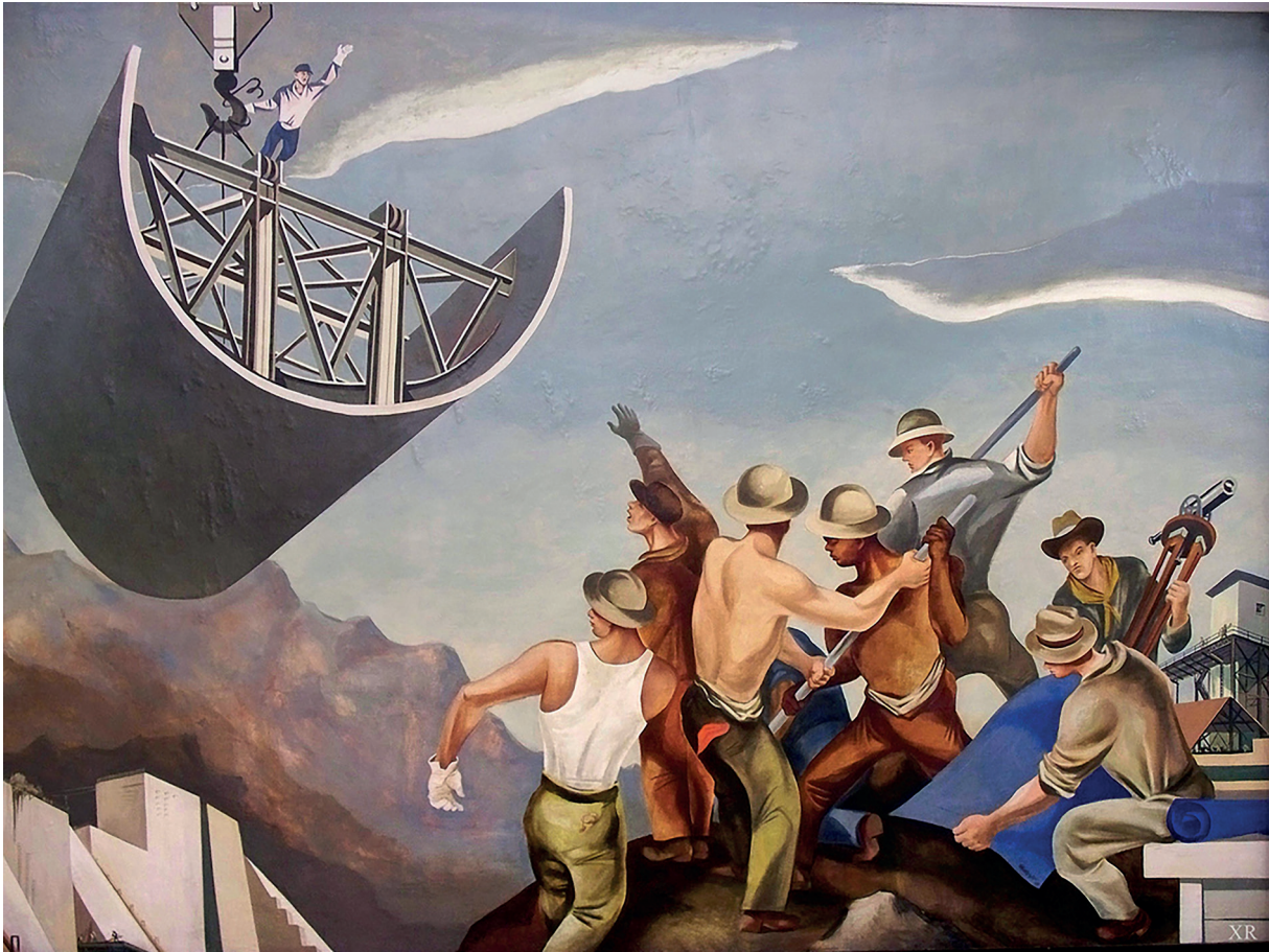
Part of a wall painting from 1938 by William Gropper showing a dam under construction in the 1930s. He was an artist paid by the Works Progress Administration.