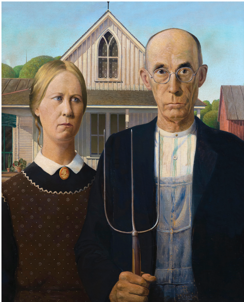
A painting from 1930 showing a farmer and his daughter.