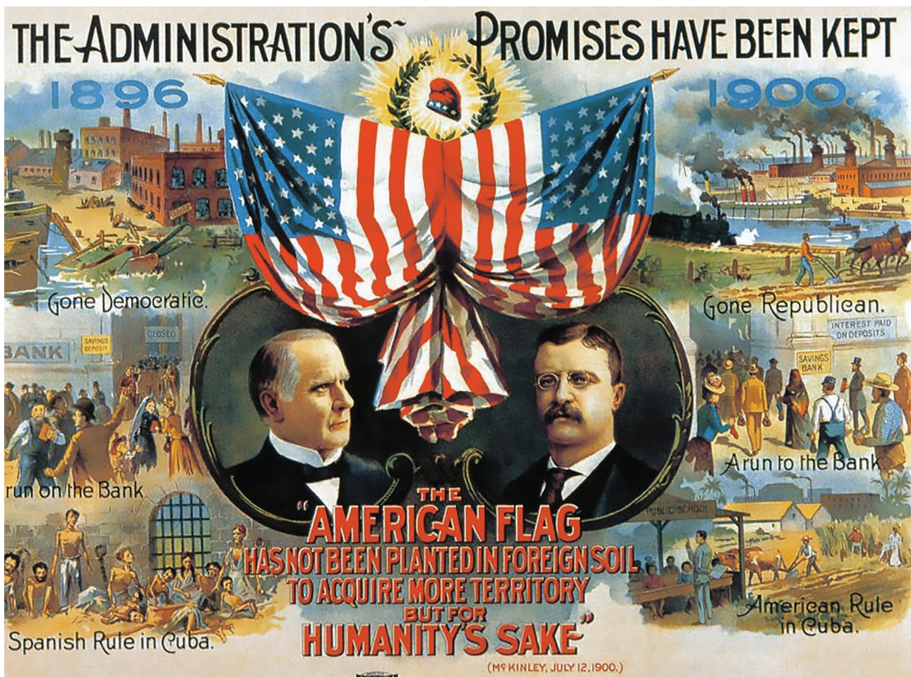
The McKinley–Roosevelt campaign poster from 1900 showing the effects of the Spanish American War.