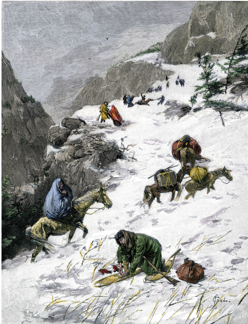
A drawing showing the dangers of crossing the Sierra Nevada mountains, 1891.