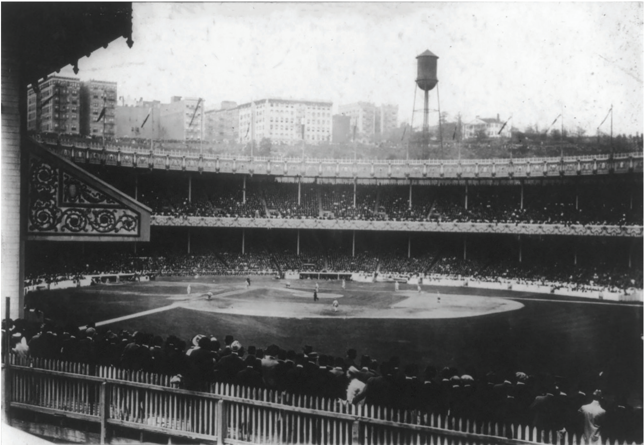
A baseball game being played in a stadium in New York in the early 1920s.