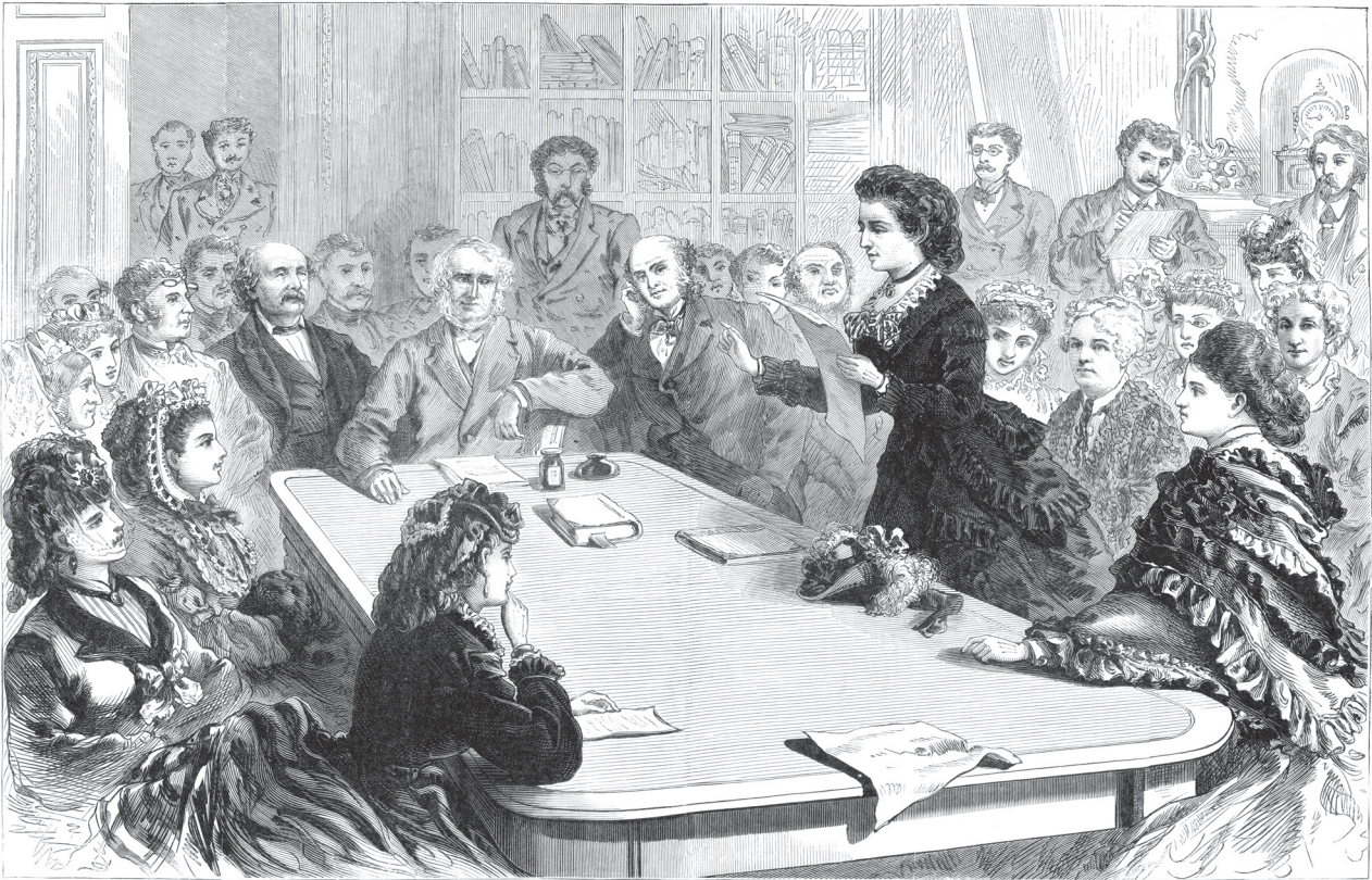
Female suffrage activists presenting their arguments in favor of women having the vote to the Judiciary Committee of the House of Representatives in January 1871.