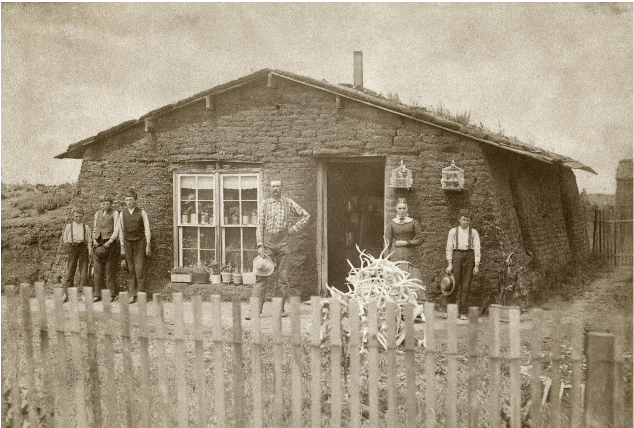
Early settlers in their sod house on the Great Plains in Loup County, Nebraska.