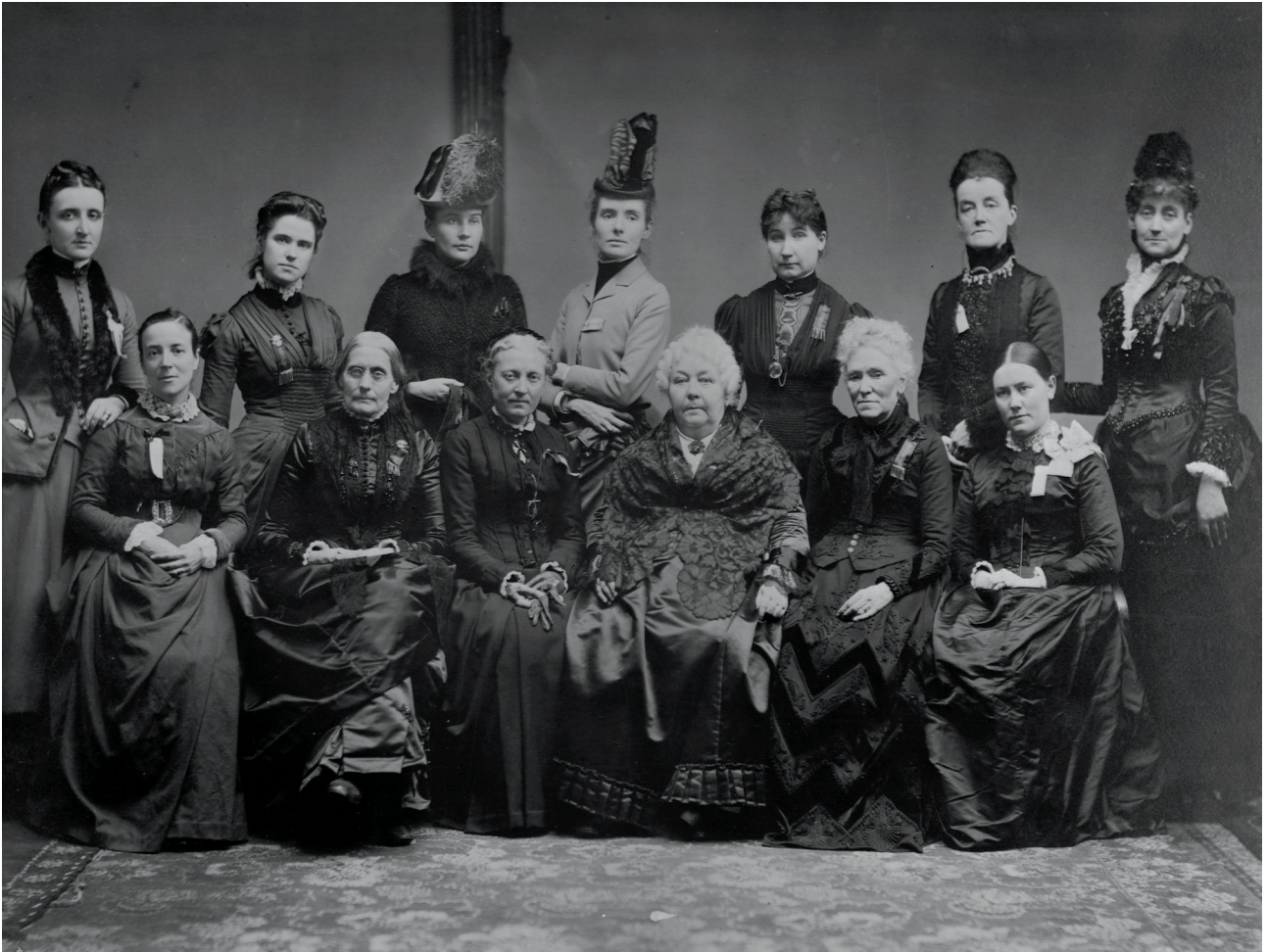
A photograph showing the Executive Committee of the National Woman Suffrage Association at its formation in May 1869. Its President was Susan B. Anthony and it had 35 female Vice-Presidents and 35 female members of the Advisory Committee.