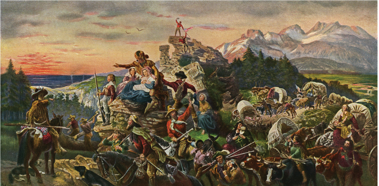
A painting by Emanuel Leutze entitled "Westward the Course of Empire Takes its Way," 1861.