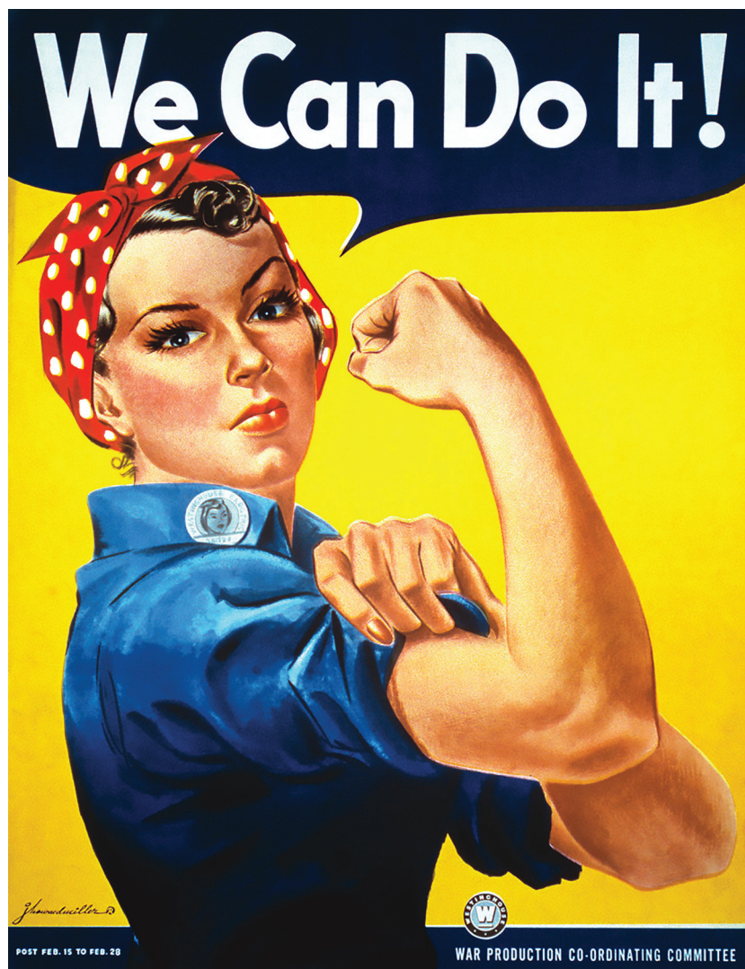
“Rosie the Riveter” recruitment poster issued by the US Government in May 1943.