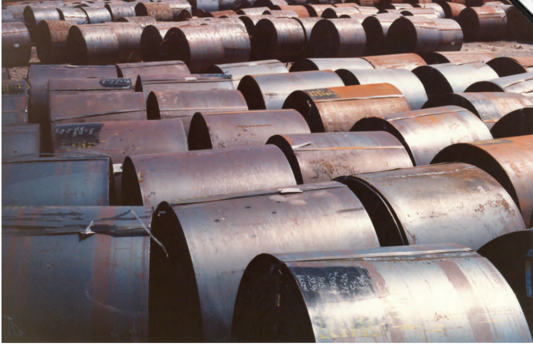
Photograph E for Question 4