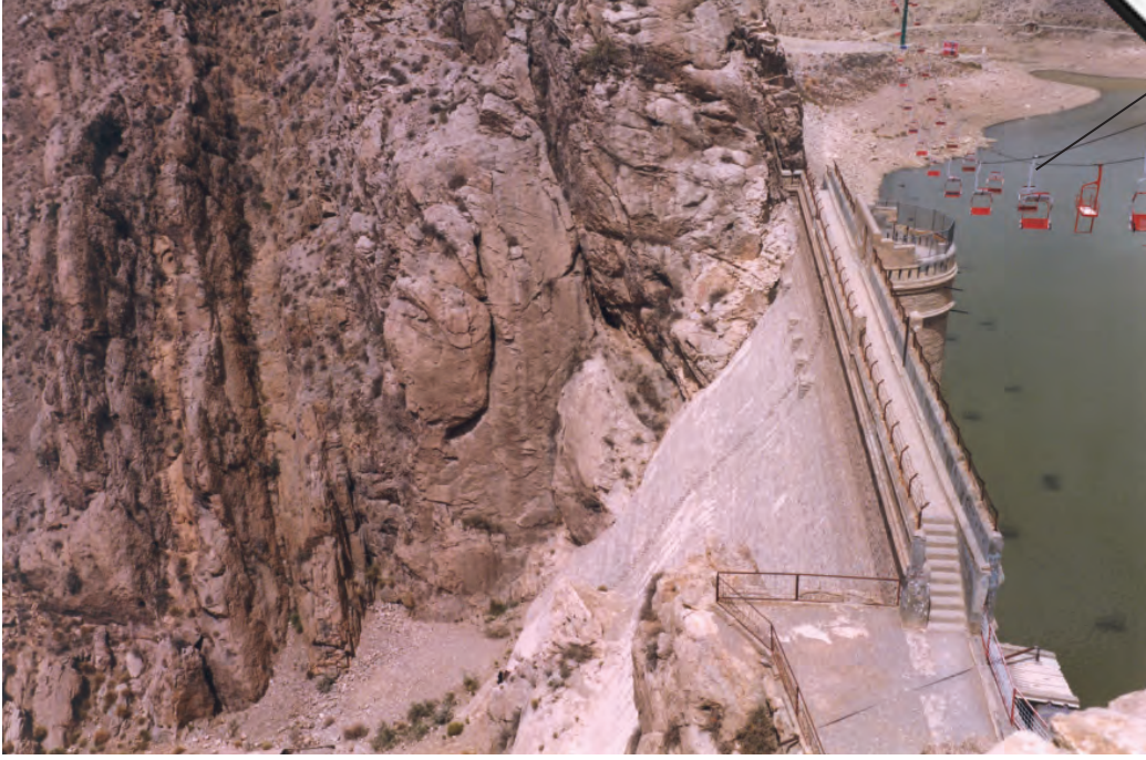
Photograph A for Question 1