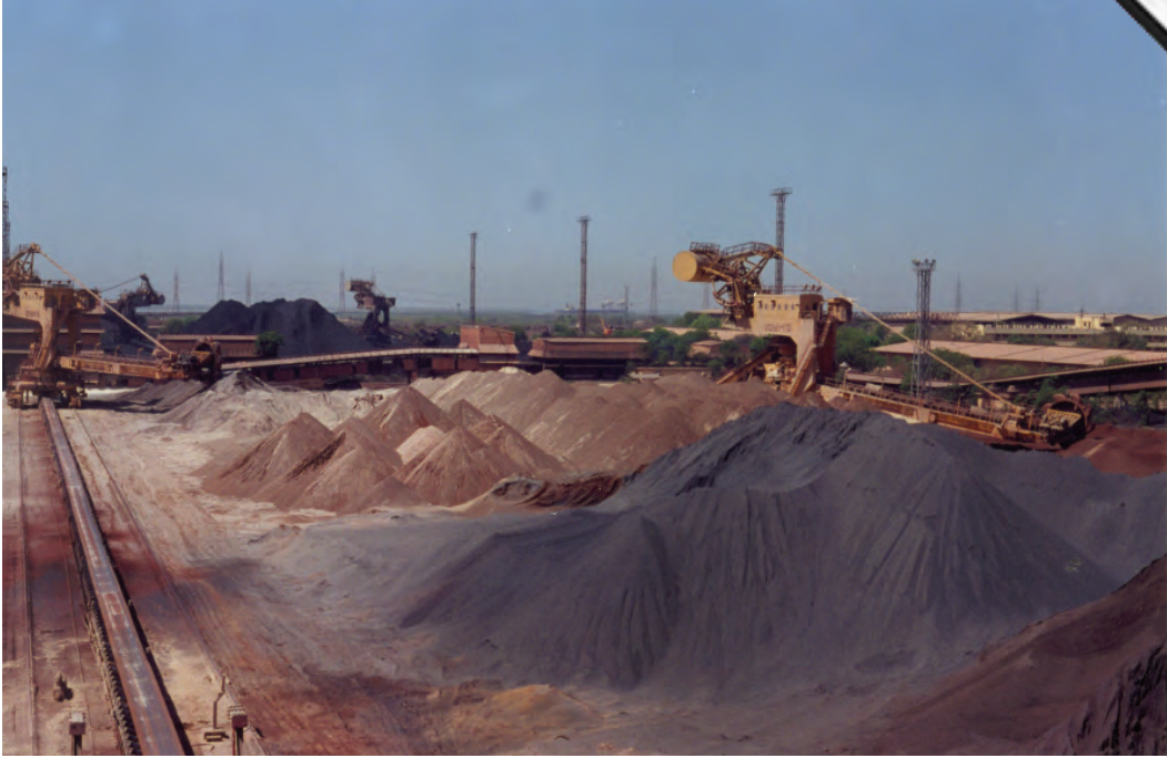
Photograph C for Question 4