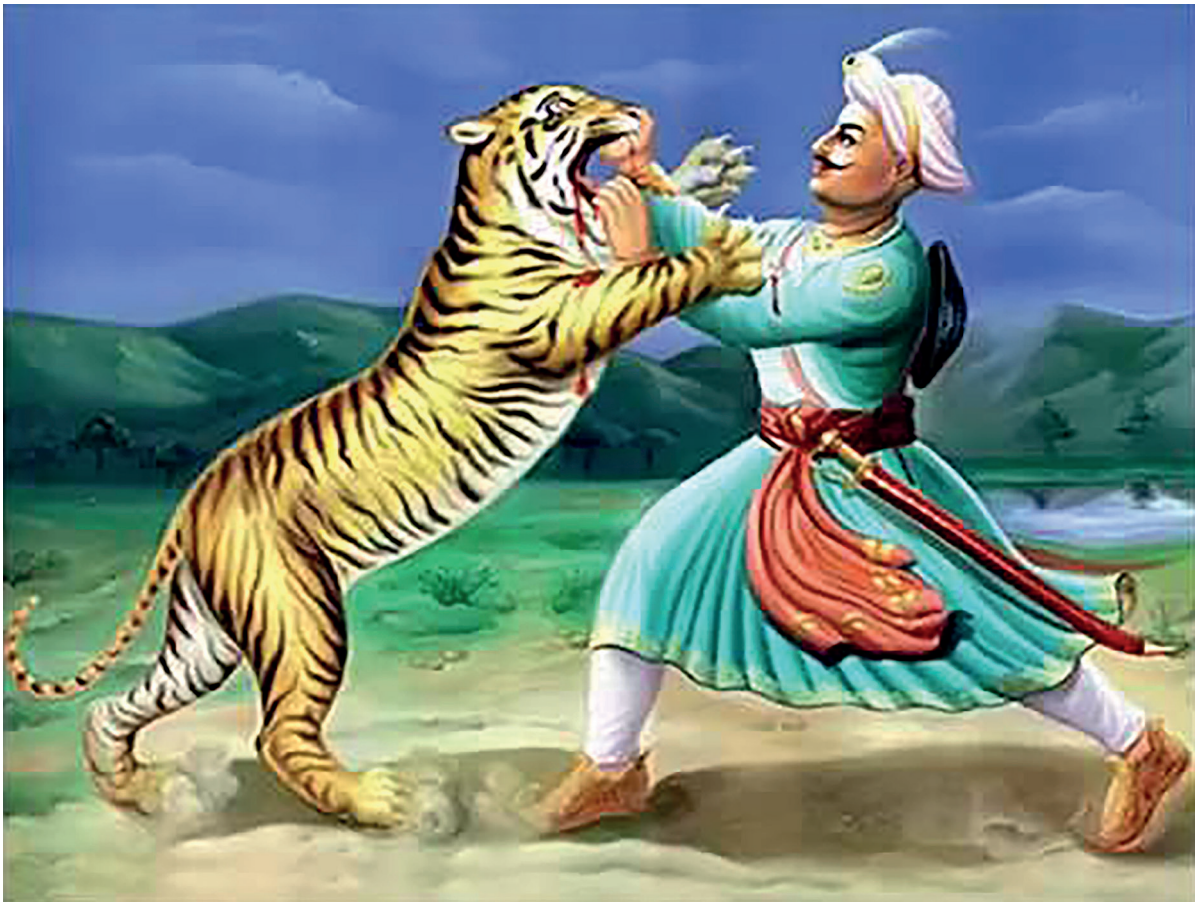
An image portraying a legend about Tipu Sultan, ruler of Mysore (artist unknown)

Permission to reproduce items where third-party owned material protected by copyright is included has been sought and cleared where possible. Every reasonable effort has been made by the publisher (UCLES) to trace copyright holders, but if any items requiring clearance have unwittingly been included, the publisher will be pleased to make amends at the earliest possible opportunity.