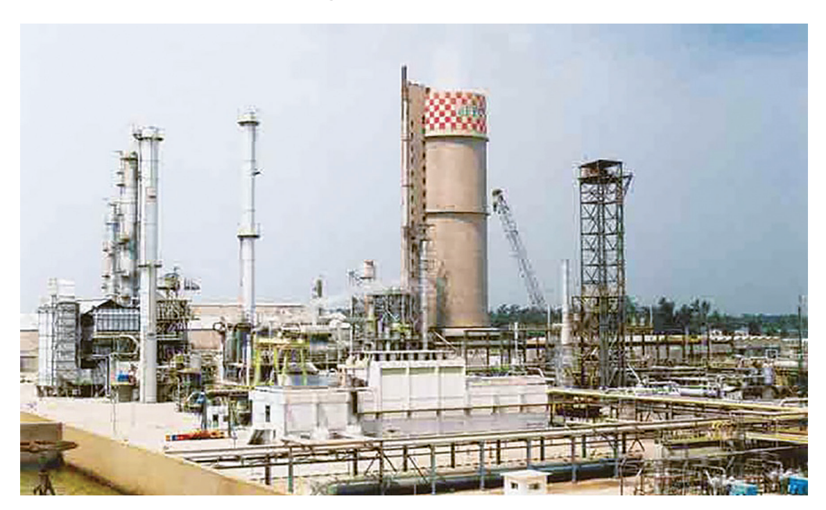
Fig. 4.2 for Question 4

The boundaries and names shown, the designations used and the presentation of material on any maps contained in this question paper/insert do not imply official endorsement or acceptance by Cambridge Assessment International Education concerning the legal status of any country, territory, or area or any of its authorities, or of the delimitation of its frontiers or boundaries.