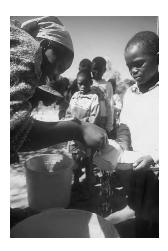
Aid agencies at work in Africa