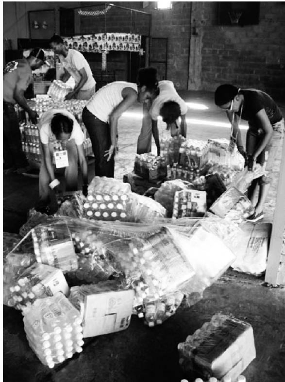
Christian volunteers helping to pack bottled water for earthquake victims.