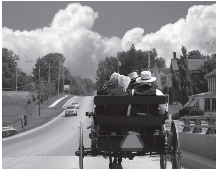
Image of the Amish travelling in a courting buggy on a road in Pennsylvania

The Amish are a religious community in Pennsylvania, USA. Their strict religious beliefs mean they reject some features of modern lifestyles, like the motor car. Individuals who do not conform to the norms of the group can face ostracism by their community. The Amish have become a tourist attraction because their way of life is so different. There can be conflict between them and the tourists as their religion means they are not happy to be photographed.