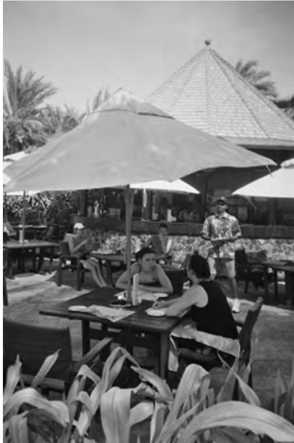
Fig. 1 (b)

(b) Many 5* resort hotels provide beachfront food and drink facilities such as the one shown in Fig. 1(b).