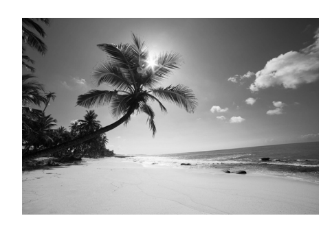
From only €699 pp

Contact your travel agent or book direct on +220 79642 311