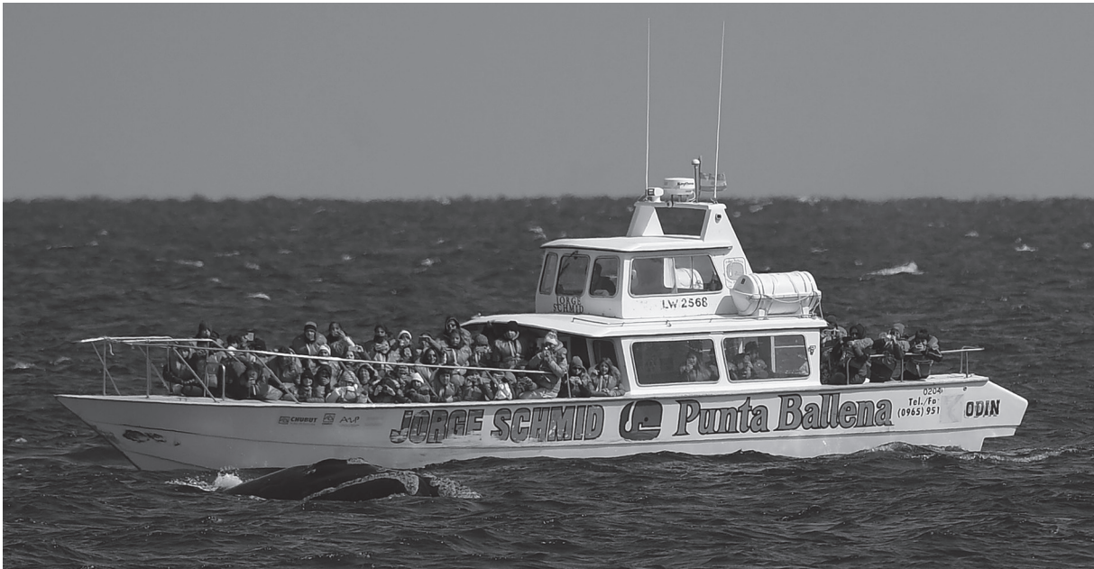
Wildlife tours are popular with tourists. The photograph above shows a whale watching tour in Argentina.