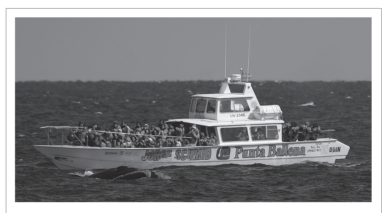
Fig. 3 for Question 3

Wildlife tours are popular with tourists. The photograph above shows a whale watching tour in Argentina.