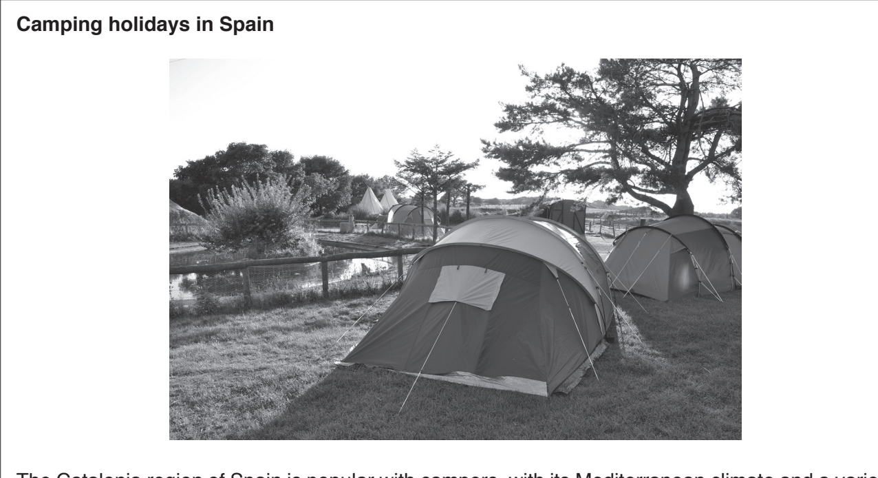
Fig. 4 for Question 4

The Catalonia region of Spain is popular with campers, with its Mediterranean climate and a variety of attractions nearby, including the historic city of Barcelona. Camping offers an affordable holiday, with low accommodation costs and no set itinerary to follow. Visitors wishing to camp can either bring their own tents and other camping equipment with them, or they can hire fully equipped tents for up to 8 people. Campers can choose whether to enjoy the fun of cooking for themselves outdoors, or to visit a nearby town to enjoy the local food at a restaurant, according to their budget. Many tourists camp during the summer months but some campsites have few visitors for the rest of the year.