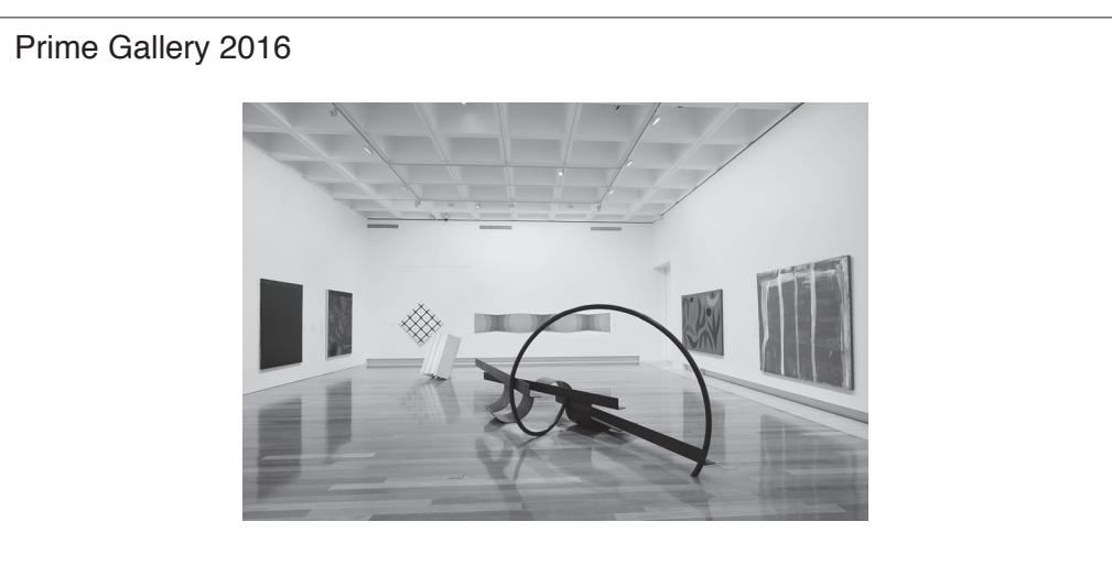
Fig. 3 for Question 3

Prime Gallery was established 25 years ago near the centre of the lively city of Melbourne, Australia. Specialising in modern art, Prime Gallery has become well known for its collection of works by leading Australian artists. Last year, however, visitor numbers declined. Two new galleries opened closer to the main shopping district. Also, a change to public transport routes means that there are fewer buses passing nearby and Prime Gallery is not close to the free tram zone.