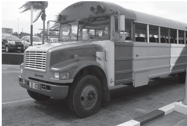
Fig. 2 for Question 2