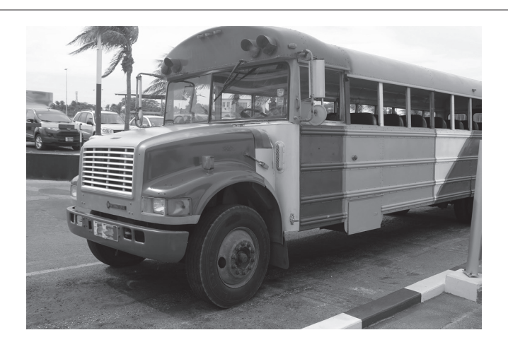
Fig. 2 for Question 2