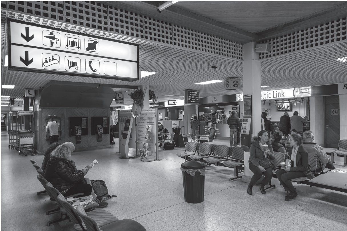
Waiting area at a ferry terminal, Rosslare, Ireland.