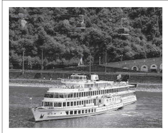
Fig. 2.1 for Question 2