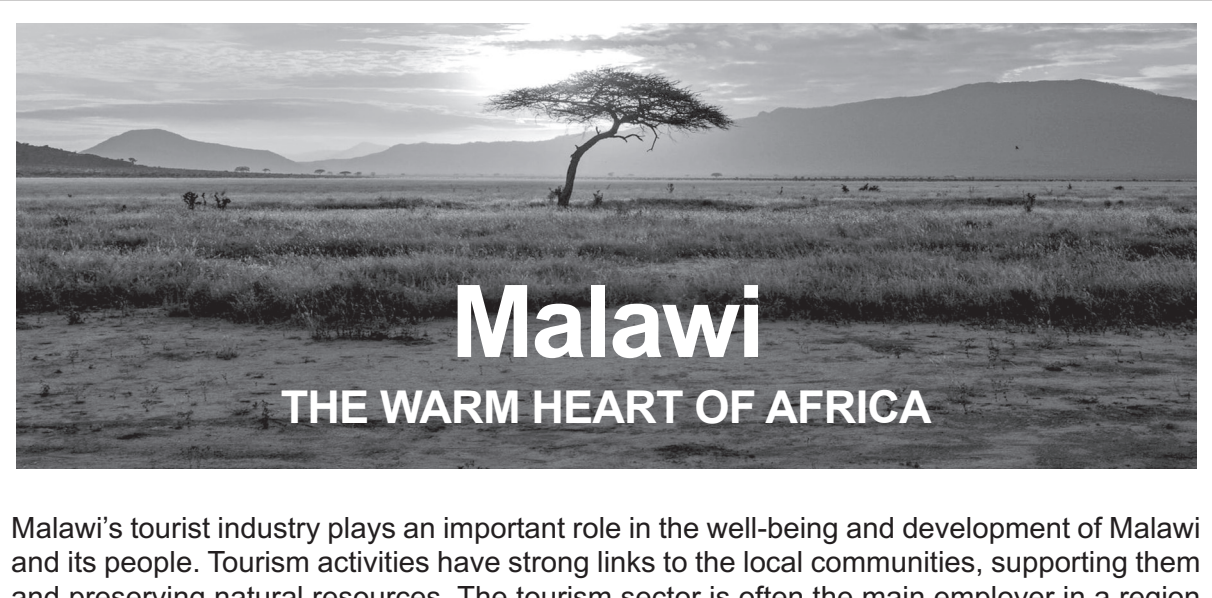
Fig. 1.1 for Question 1

and preserving natural resources. The tourism sector is often the main employer in a region and therefore benefits from a growth in tourist numbers.