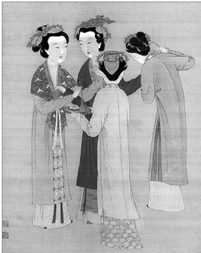
'Four Beauties', a Ming Dynasty painting

Extract adapted from an article on an English-language website sponsored by the Chinese Ministry of Culture