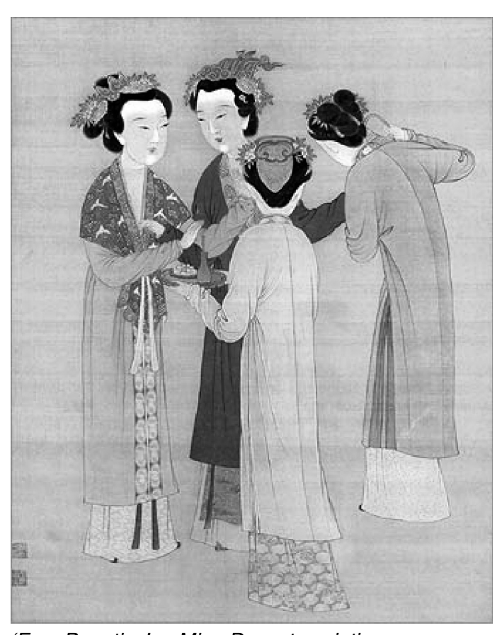
'Four Beauties', a Ming Dynasty painting

Extract adapted from an article on an English-language website sponsored by the Chinese Ministry of Culture